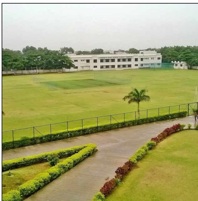
Photo of cricket ground

About Cricket Ground: - Green Grass Standard Cricket Ground with All the Facilities is Available in College Campus. The Cricket ground having following facilities:-