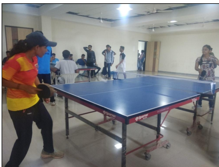
Photo of table tennis

About table tennis: - Wooden table court with All the Facilities is Available in College Campus. The table tennis court having following facilities:-