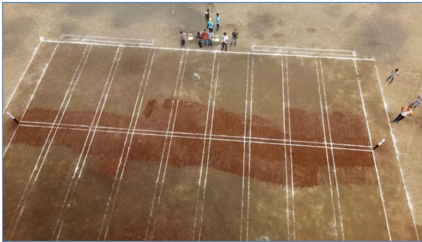
Photo of Kho Kho ground

About KhoKho Ground: - Clay Standard KhoKho court with All the Facilities is Available in College Campus. The kabaddi ground having following facilities:-