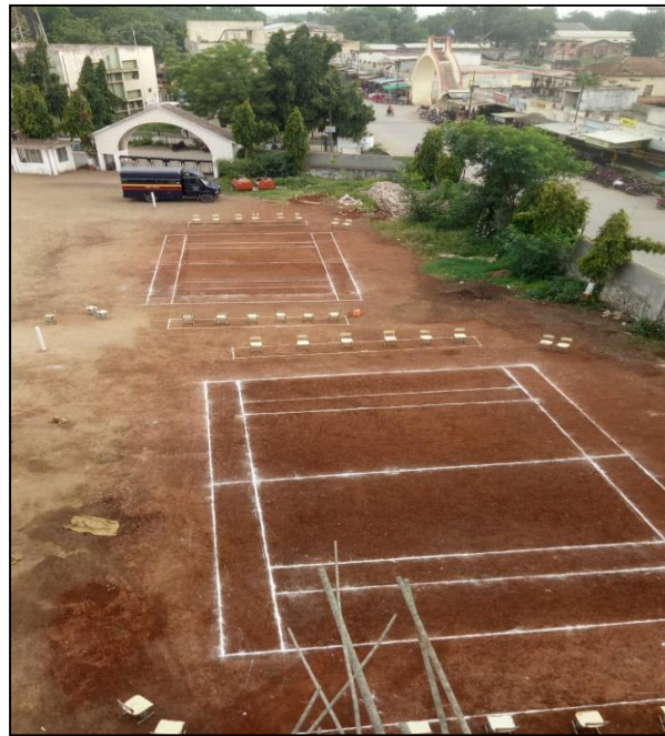
Photo of kabaddi ground

About kabaddi Ground: - Clay Standard kabaddi court with All the Facilities is Available in College Campus. The kabaddi ground having following facilities:-