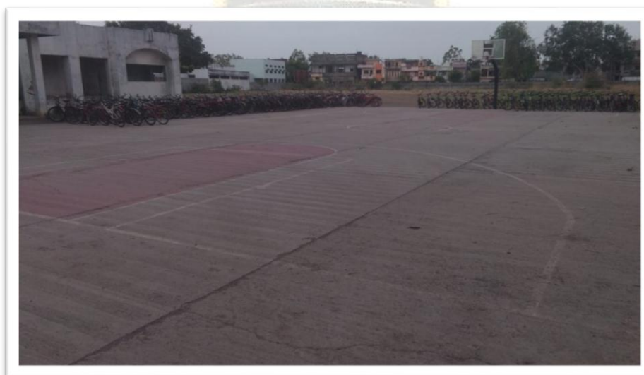
Photo of basketball court-