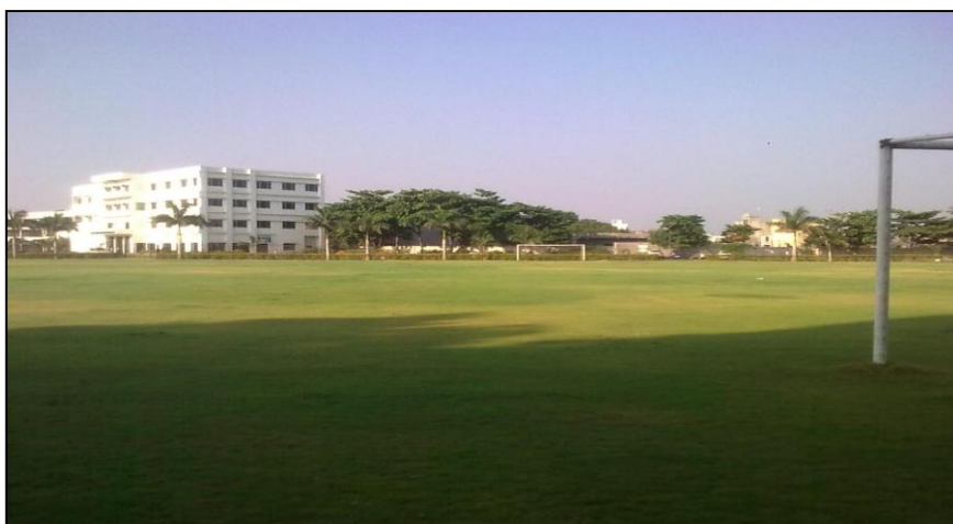
Photo of football ground

About Football Ground: - Green Grass Standard football Ground with All the Facilities is Available in College Campus. The football ground having following facilities:-