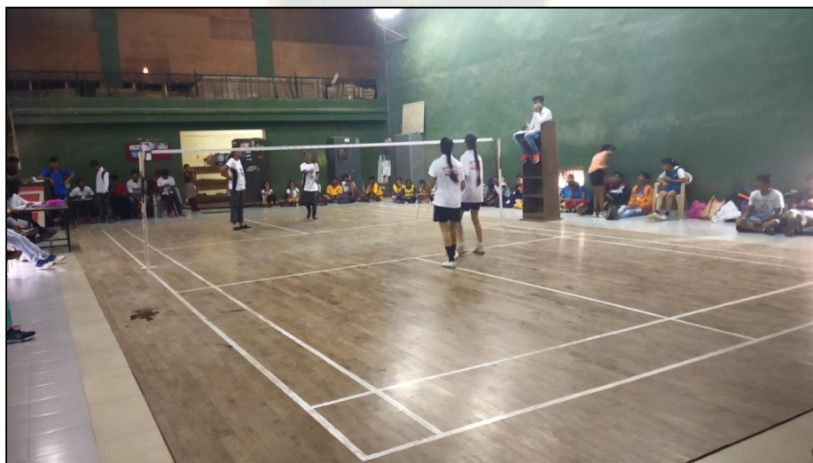
Photo of badminton court

About badminton court: - Wooden badminton court with All the Facilities is Available in College Campus. The badminton court having following facilities:-