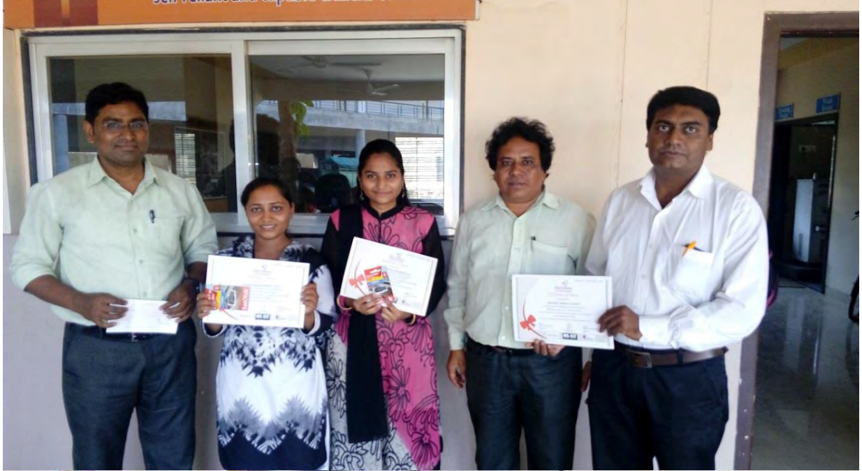
Students Prize Winning Occasion Curricular & Co-curricular Activities

DEPARTMENT OF ENGLISH : Student Development Activities (2015-16 to 2019-20)