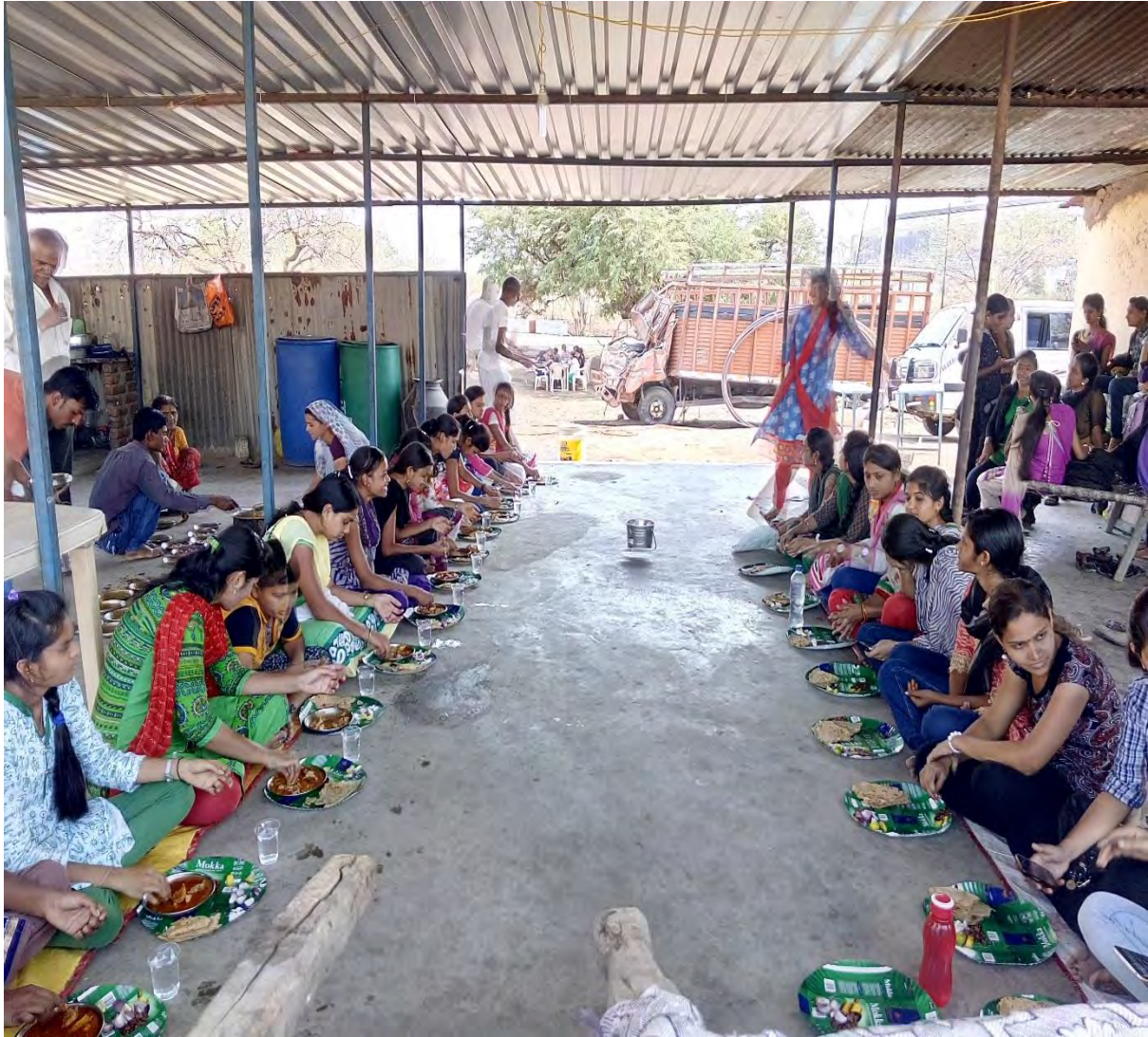
Students Get-together (March 2016)

DEPARTMENT OF ENGLISH : Student Development Activities (2015-16 to 2019-20) =====