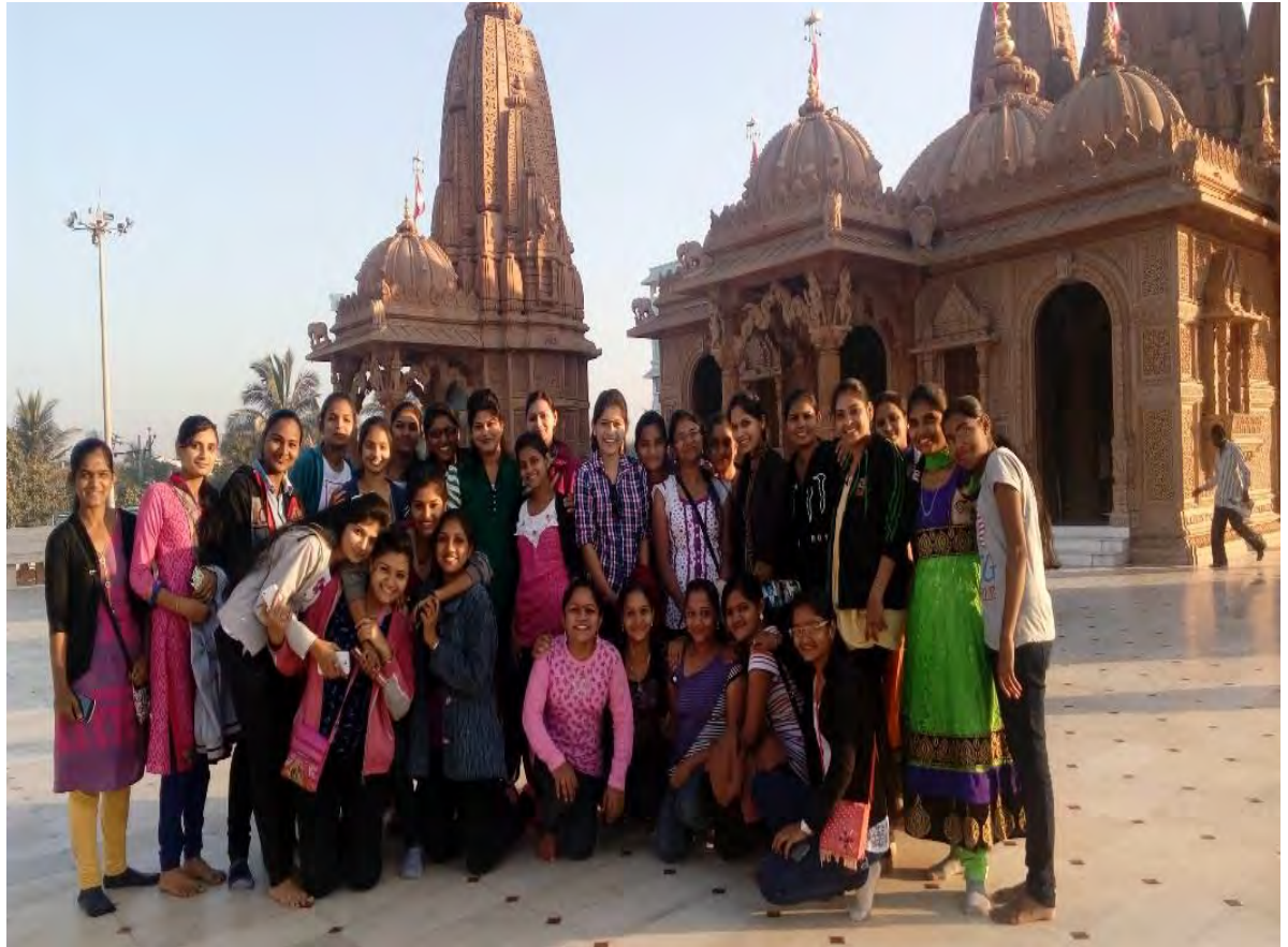
Paper Reading Competition 13-02-2016

DEPARTMENT OF ENGLISH : Student Development Activities (2015-16 to 2019-20)