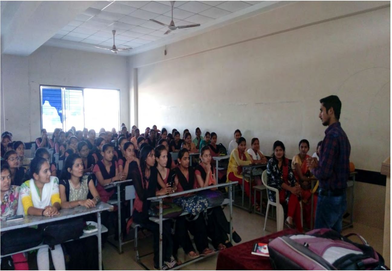
English day Celebration 14-02-2018