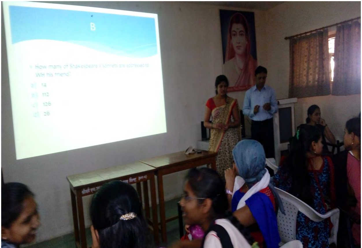
Farewell Function (March 2016)